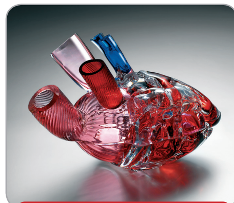
1 st prize "Dish with a Lid" 2007 Dirty Design Studio - Czech Republic