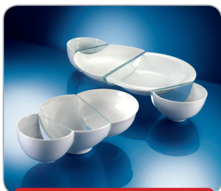
1 st prize "Snack-Bowl Set" 2006 Katalin Tomay - Hungary