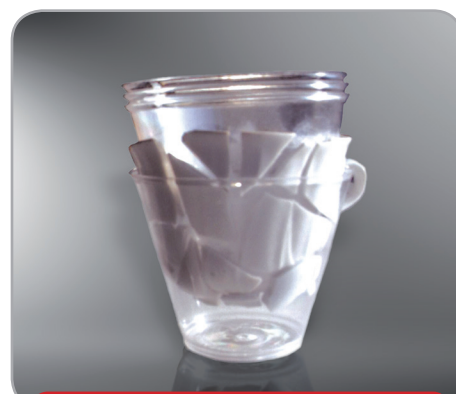
1 st prize "Cup" 2004 Slobodan Roksandic - Serbia