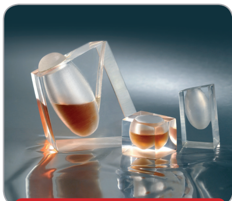
1 st prize "Tea for two" 2009 Nebojša Momčilović - Serbia