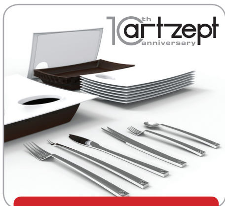
1 st prize "Fish & Seafood Cutlery" 2013 Gianmarco Brunacci - Luca Zenobi - Italy