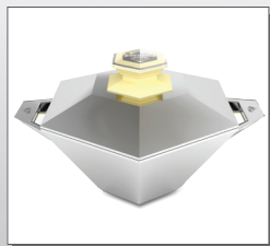
Olah Balázs Bulgaria