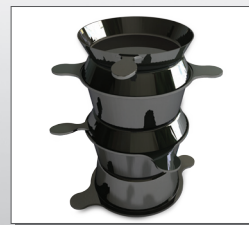
Sada Shirafuji The Netherlands