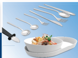
Salvo Bonura Davide Salvatico Italy