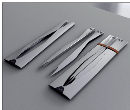
2 nd Prize 4,000 € worth of Zepter products

Gianmarco Brunacci and Luca Zenobi – Italy