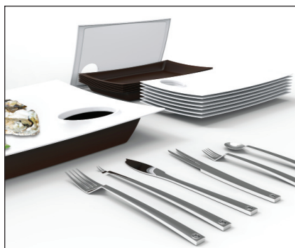
1 st Prize 10,000 €

3 rd Prize - 3,000 € worth of Zepter products to Anya Chetverikova , Russia