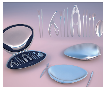
3 rd Prize 3,000 € worth of Zepter products